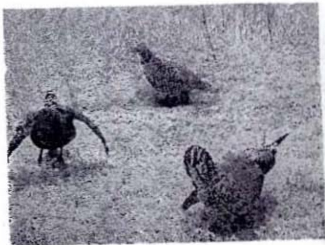
The Prairie Chickens go into their dance.

The Commission's force of game protectors capably discharged the many responsibilities and duties assigned to it during the year. The action of many courts of assessing large fines against convicted law breakers was a matter of gratification and encouragement to our law-enforcement officers. In other years it became a custom practice of the lower courts to assess only the minimum fine against those who were convicted of violating the fish and game laws. Such fines naturally did not deter the persistent game-law violators from their evil ways. They had no fear of the courts or of small fines. They could continue to engage in their sharp practices often with a profit even after the fine had been assessed against them. Larger fines will be the means of reducing the number of law violators to a minimum and in hastening that happy, but unlooked-for day when game can go through from season to season unmolested.