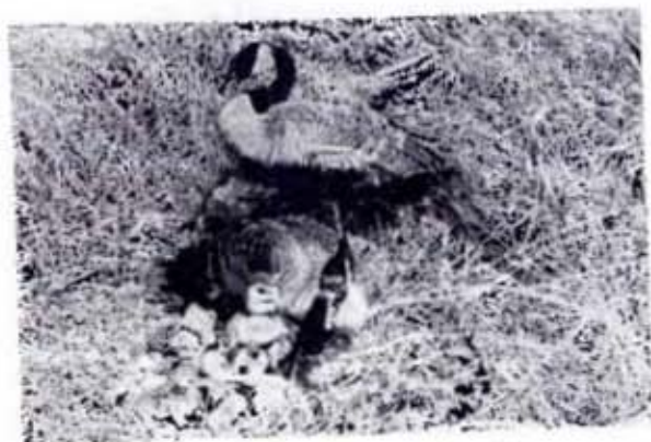
A pair of Canada geese and brood.

plumage, and as he rushes on the foe hisses with the intensity of anger. The whole flock seems to stand amazed, and opening up a space, the birds gather round to view the combat. The bold bird who has been caressing his mate scarcely deigns to take notice of his foe, but seems to send a scornful glance toward him. He of the mortified feelings, however, raises his body, half opens his sinewy wings, and with a powerful blow, sends forth his defiance. The affront cannot be borne in the presence of so large a company, nor indeed is there much disposition to bear it in any circumstances; the blow is returned with vigor, the aggressor reels for a moment, but he soon recovers, and now the combat rages. Were the weapons more deadly, feats of chivalry would now be performed; as it is, thrust and blow succeed each other like the strokes of hammers driven by sturdy forgers. But now, the mated gander has caught hold of his antagonist's head with his bill; no bulldog can cling faster to his victim; he squeezes him with all the energy of rage, lashes him with his powerful wings, and at length drives him away, spreads out his pinions, runs with joy to his mate, and fills the air with cries of exultation."